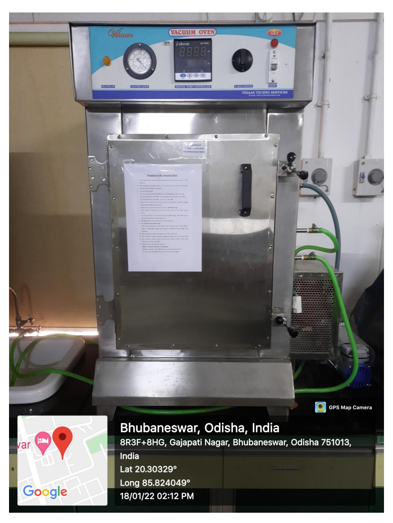
6. VACUUM OVEN