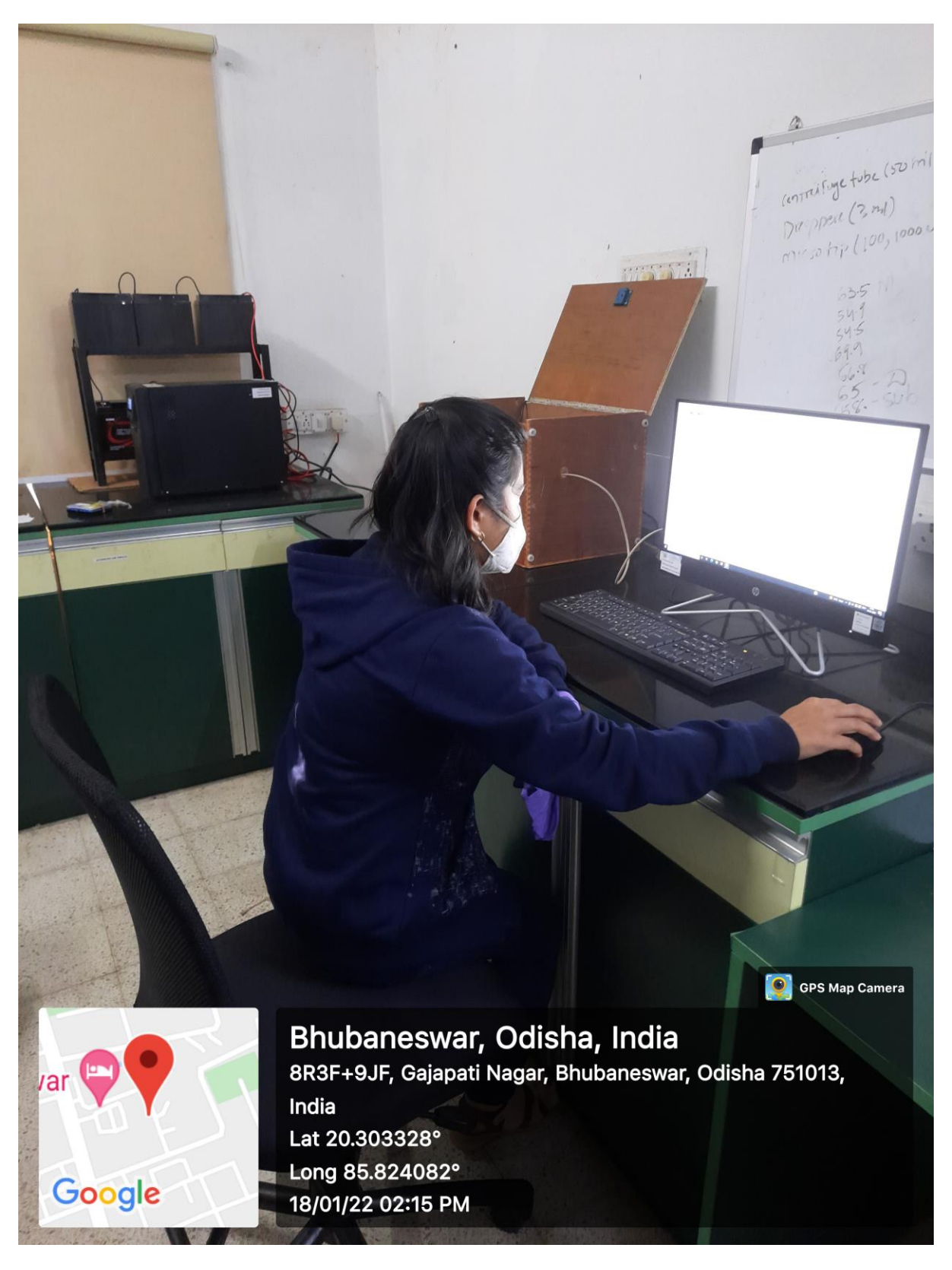
5. LED CHARACTERISTICS SETUP